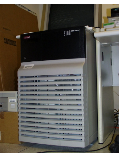
Figure 1: DEC AlphaServer 2100

Elettra was built in the early nineties, starting operating with its first beam in 1993. At that time, the main storage facility for scientific data (as well as the technology for data analysis) was based on a number of DEC AlphaServer 2100 and VAXstation machines running OpenVMS and, lately, Tru64 Unix (Fig. 1). When the use of personal computers became common, these were widely used as storage systems at the beamlines against the DEC servers; as a side effect, this led to a very etherogeneous situation with no centralised standard of access for the data. After a number of years this anarchic situation came to an end: a more organised approach was mandatory, and the needs for a high performance, reliable, centralised storage were born.